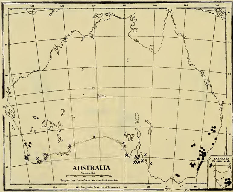
Fig. 2.—Map showing distribution of Pelargonium spp. P. littorale , ×; P. helmsii , ▲; P. inodorum , ●.

Annual or perennial herbs or low shrubs. Leaves simple or almost compound, dentate, lobed to deeply dissected, hairy with long simple hairs and short glandular ones or almost glabrous, often aromatic; margin sometimes undulate. Flowers